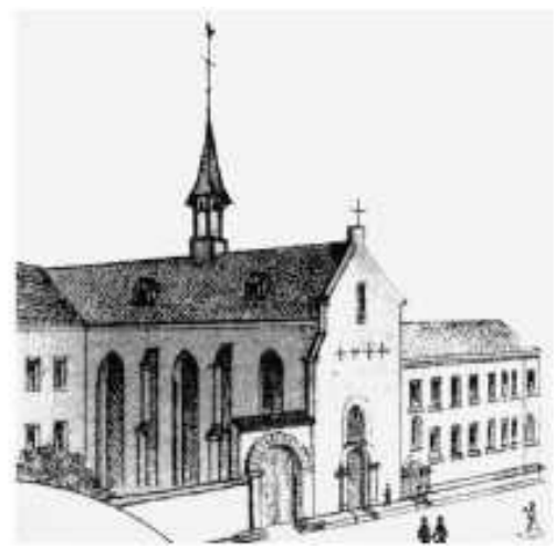
Chapel and abbey of the Alexian Brothers on the eastern side of Brückstrasse (now the Romaneum) around 1877