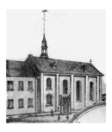
Hospital church on the west side of Brückstrasse around 1877