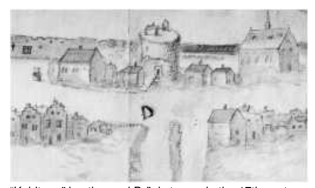
"Kehlturm" bastion and Brückstrasse in the 17th century