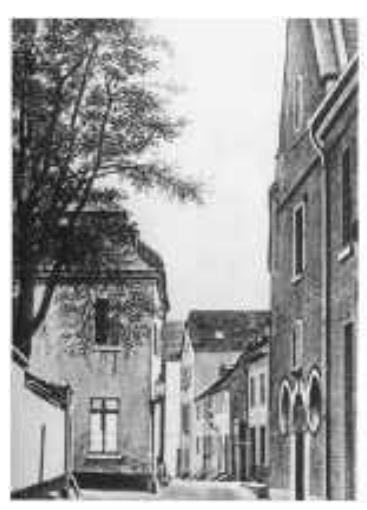
Brückstrasse looking north with the Alexian chapel (right) around 1930