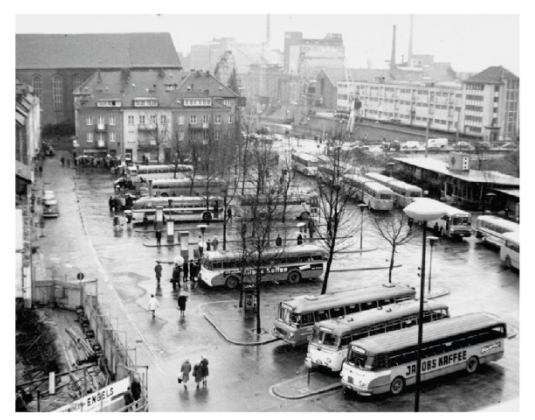
Central bus station around 1960