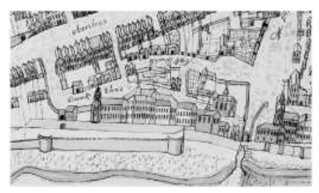
Brückstrasse in the 18th century