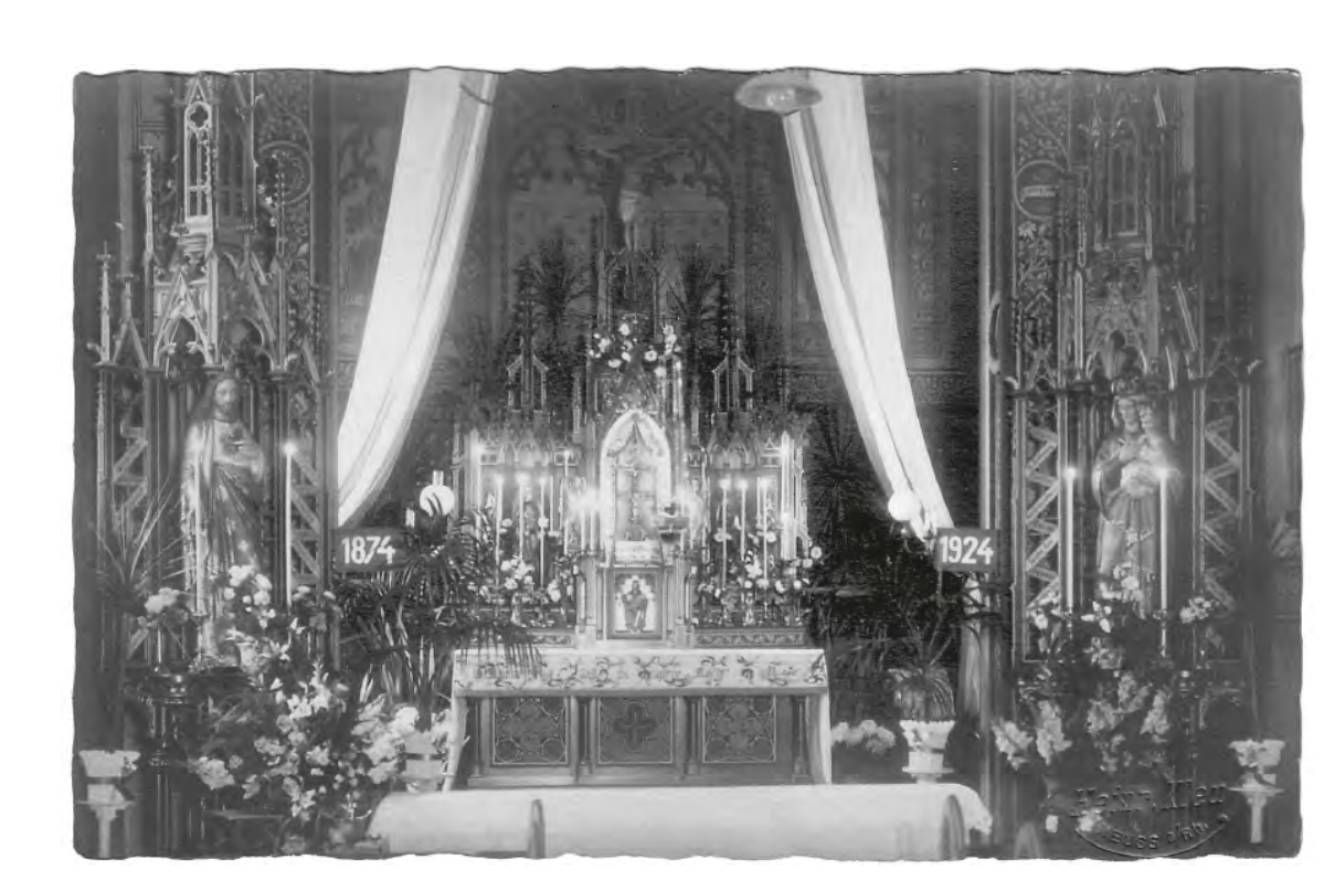
The convent chapel decorated on the occasion of festivities to mark the 50-year celebration of the acquisition of the chapel and the convent, 1924