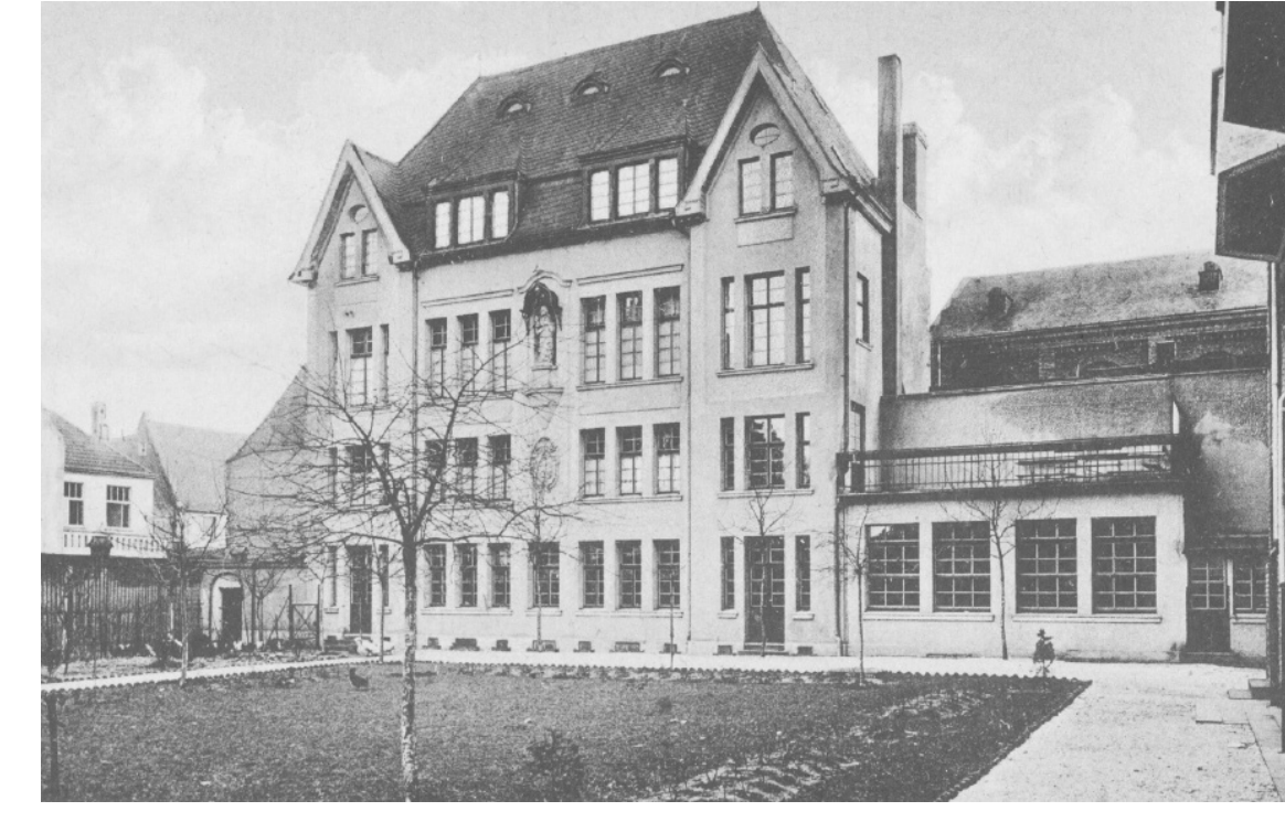
The so-called 'White House' in the convent's garden, around 1910

(Sources and texts: Neuss municipal archives)