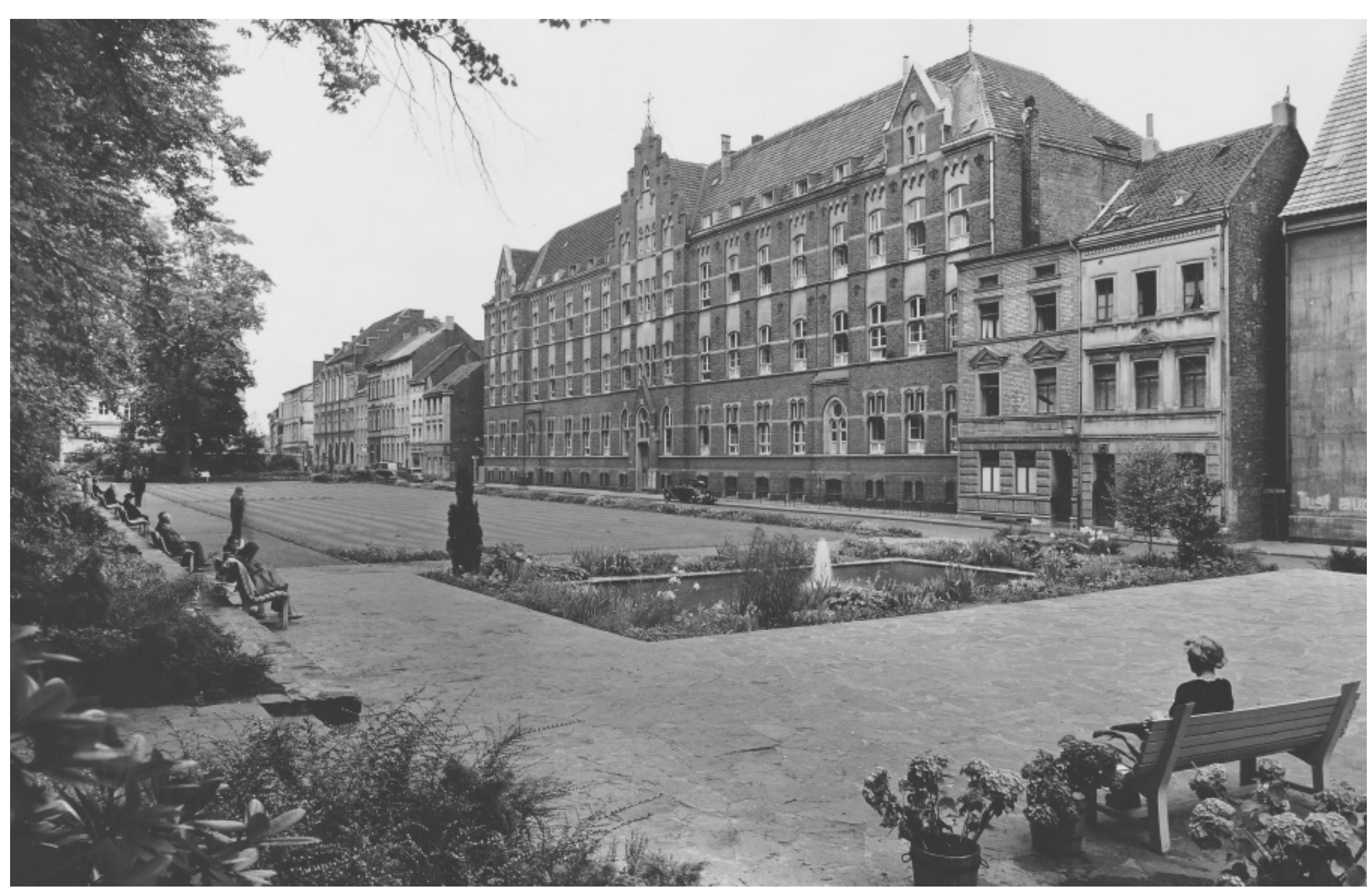
View of the main building from the Promenade, 1950s

Also belonging to the new convent complex was the so-called 'White House' a classical outbuilding built in the convent's garden around 1909. It housed a home economics school with boarding school and the utility rooms for the sisters of the order. In addition, a nursing home for older women and a nursing school were also located in the convent buildings.