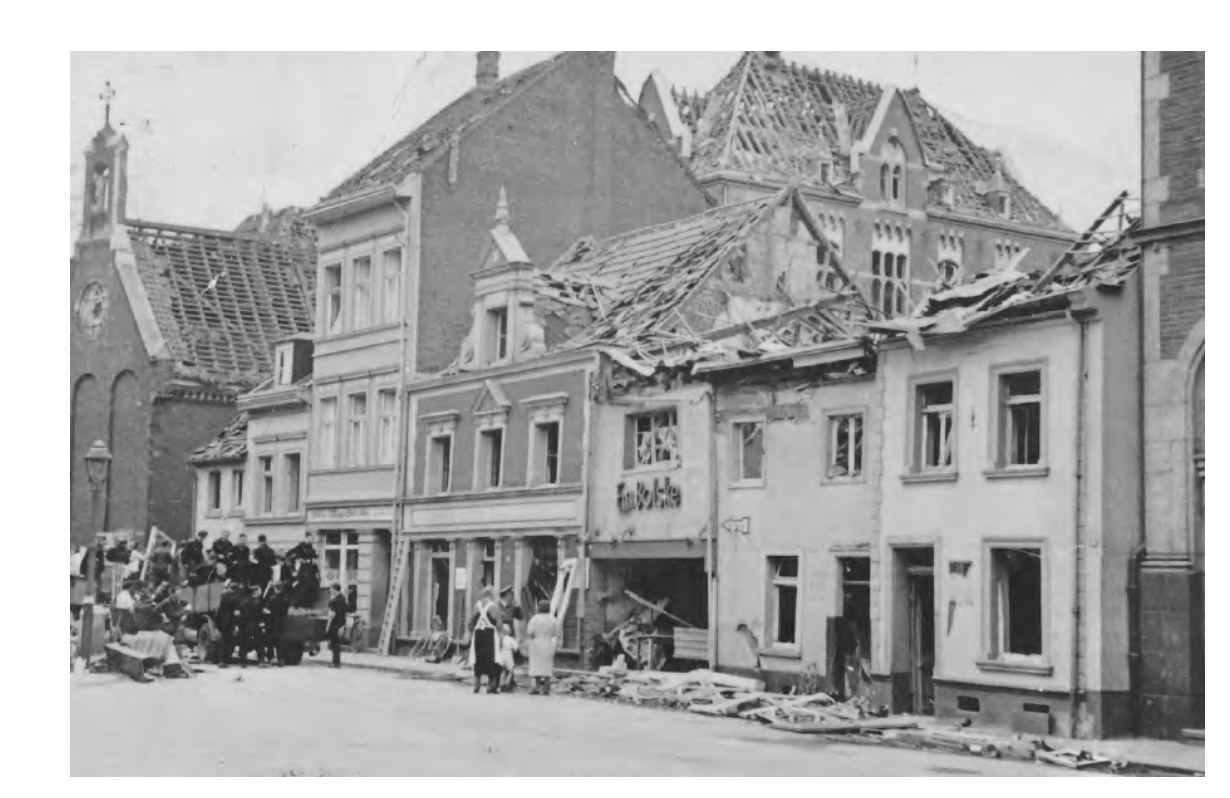
The chapel of the Sacred Heart Convent on Michaelstrasse after an air raid, 1942