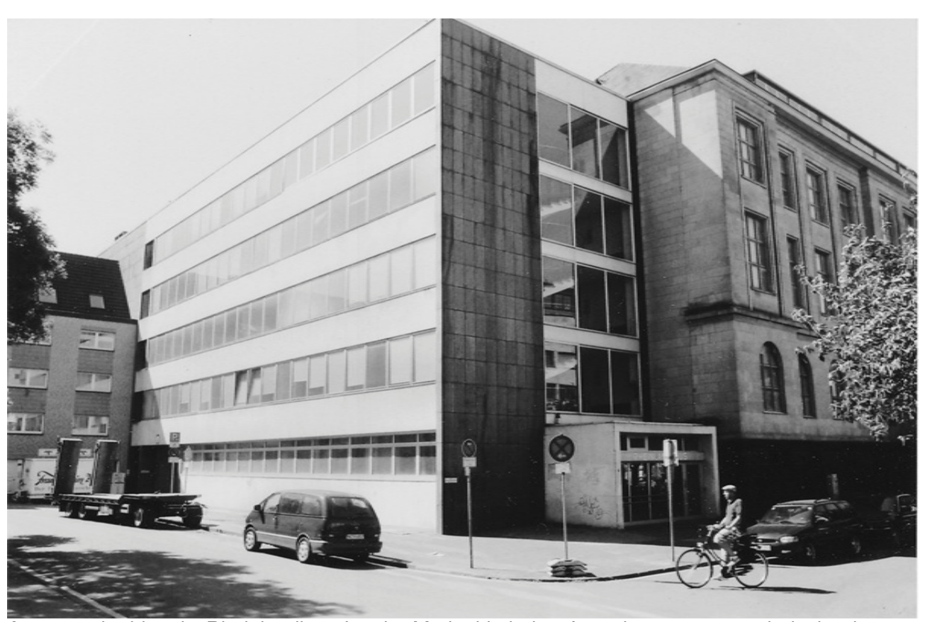
Annex to the historic 'Rheinlandhaus' at the Marienkirchplatz from the post-war period, shortly before the demolition in the year 2006