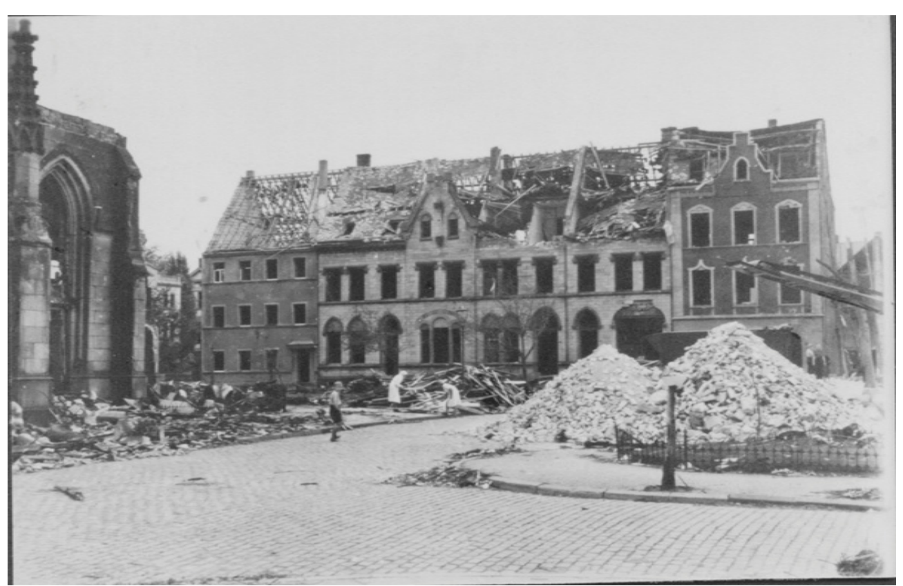
The northern part of the 'Rheinlandhaus' was destroyed during air raids in 1942 and 1944.