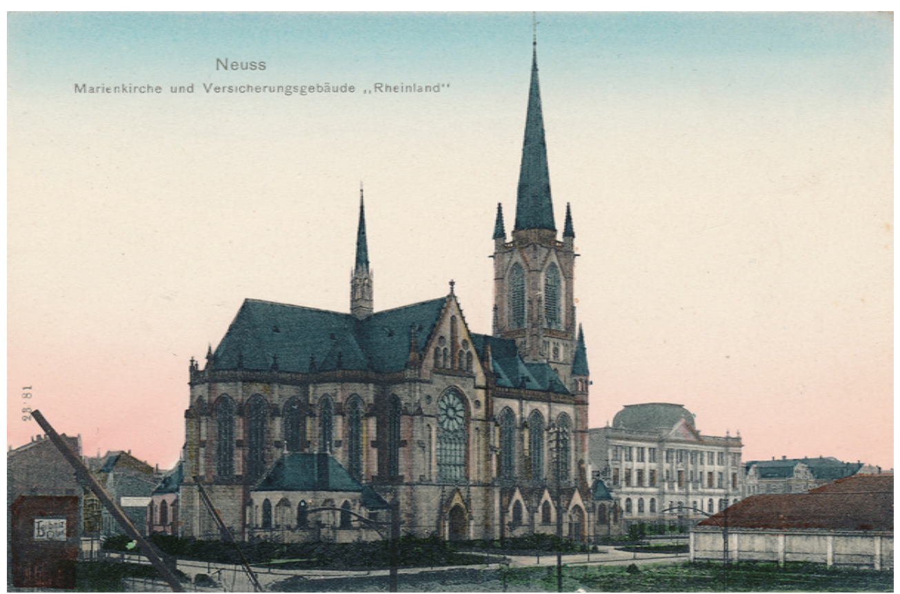
The 'Marienkirche' church, completed in 1902, on the grounds of the former Catholic cemetery; the 'Rheinlandhaus' in the background, around 1910