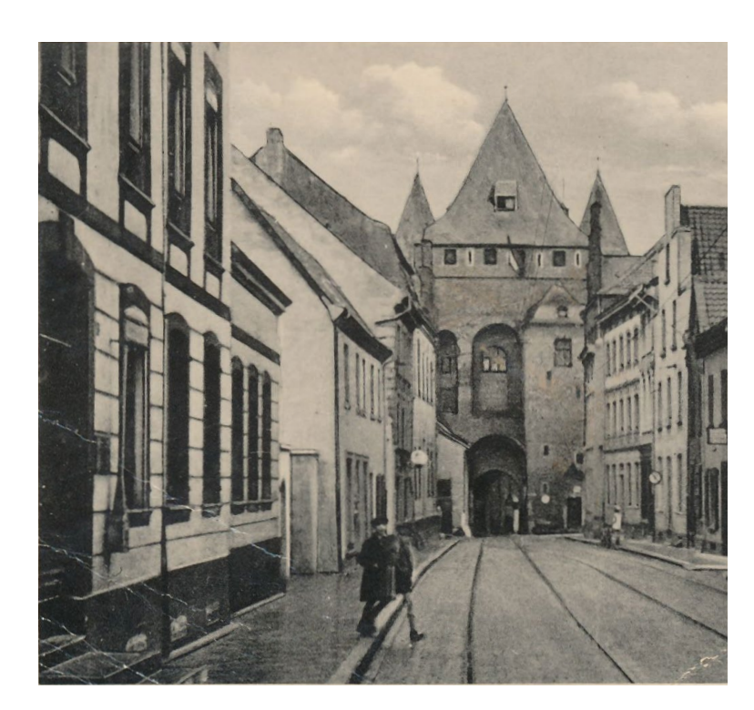
The building at 15 Oberstraße (left) with a view of the Obertor gate, postcard, around 1930