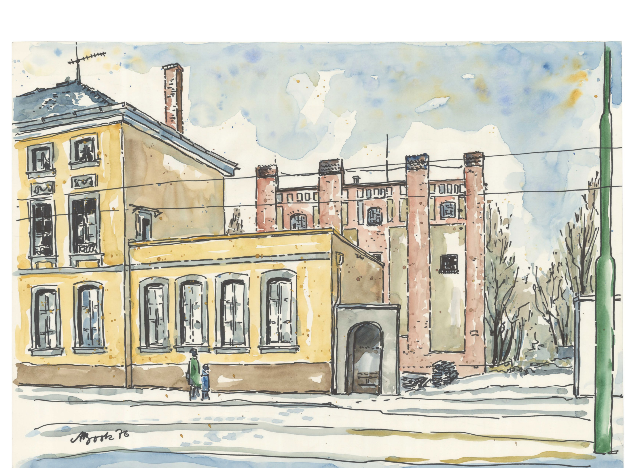
Neuss municipal archive in the former post office (1778) and candle warehouse (1909), watercolour by Alfred Book, 1976

The Neuss municipal archive was first mentioned in a document in 1242 ("archivum publicum Nusie") and is therefore one of the oldest in Germany. Until the 17th century, the archive was part of the city registry on Krämerstraße, after which it was located in the town hall by the market, built in 1638 and destroyed in 1944. After the relocation of the archive holdings and their provisional rehousing due to the war, the archive has been located in two listed buildings on Oberstraße since 1967. Administration, a reading room as well as an events and exhibition room are located in the former Thurn und Taxis post office, with the repository in the adjoining former candle warehouse.