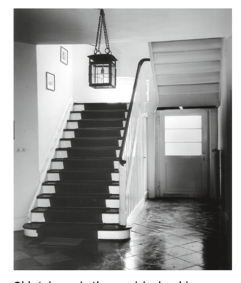
Old staircase in the municipal archive, photograph, 1969

1586 1851 1967 1778 2007 1242 2024 1944 First mention of the Fire in the city destroys Construction of the Former post office Outsourcing of archives/ Municipal archive in the former Ground floor renovated Archive building "archivum publicum Nusie" parts of the archive Thurn und Taxis post office becomes a candle factory destruction of the town hall post office and candle factory as a public area extension 1638 2009 1945