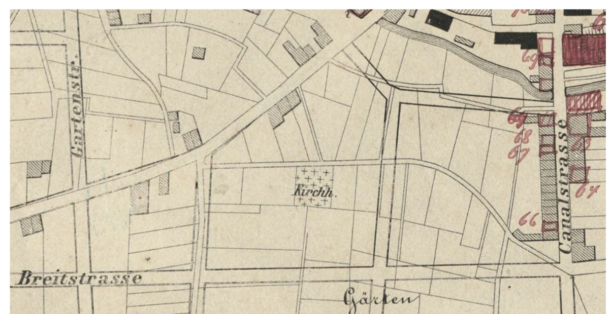
The old Protestant churchyard between Büttgerstraße and Breite Straße, 1873