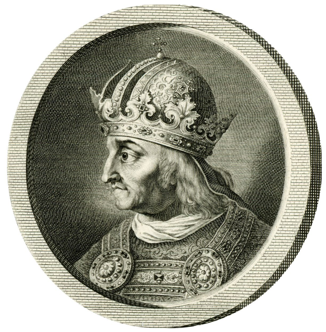
Emperor Friedrich III (1415–1493)