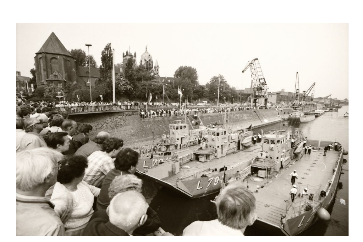
Event in Dock 1 on the occasion of the 4th Hanseatic Day of the Modern Age in Neuss on the Rhine in June 1984